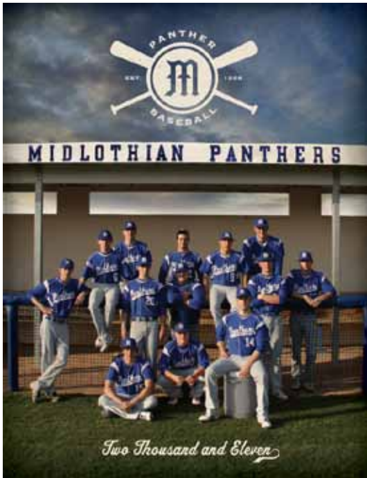
( 2011 COVER )